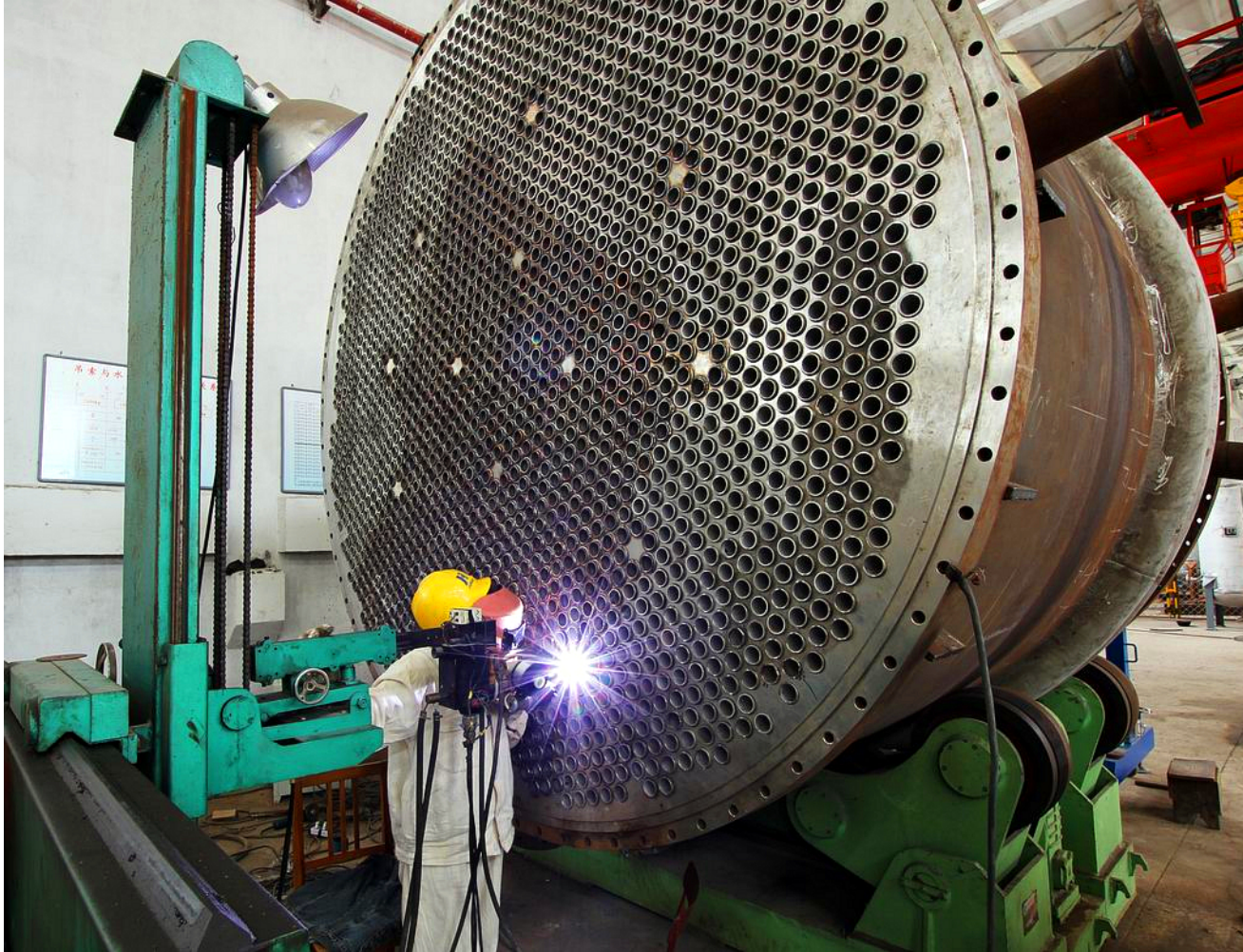
The Processing of Heat Exchanger