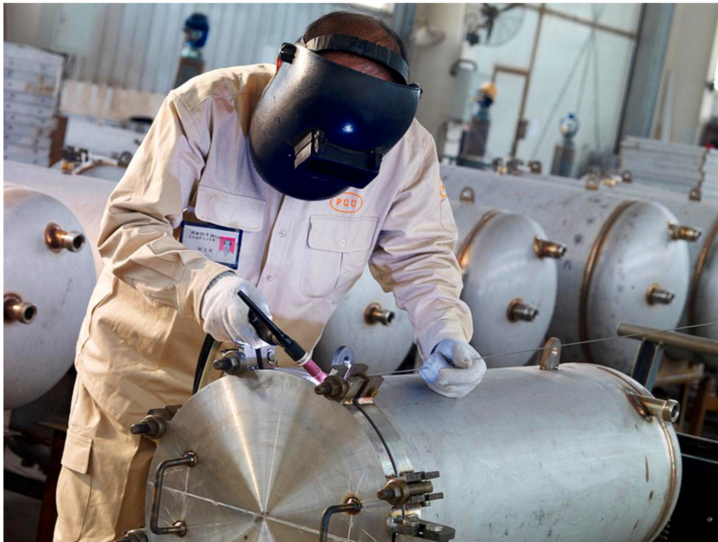
PALL HCP Tank