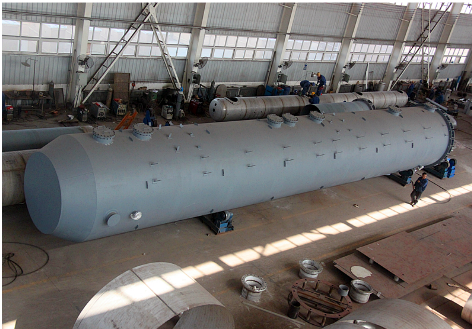
Kaifeng Air-separation Water Cooling Tower \Phi 3000