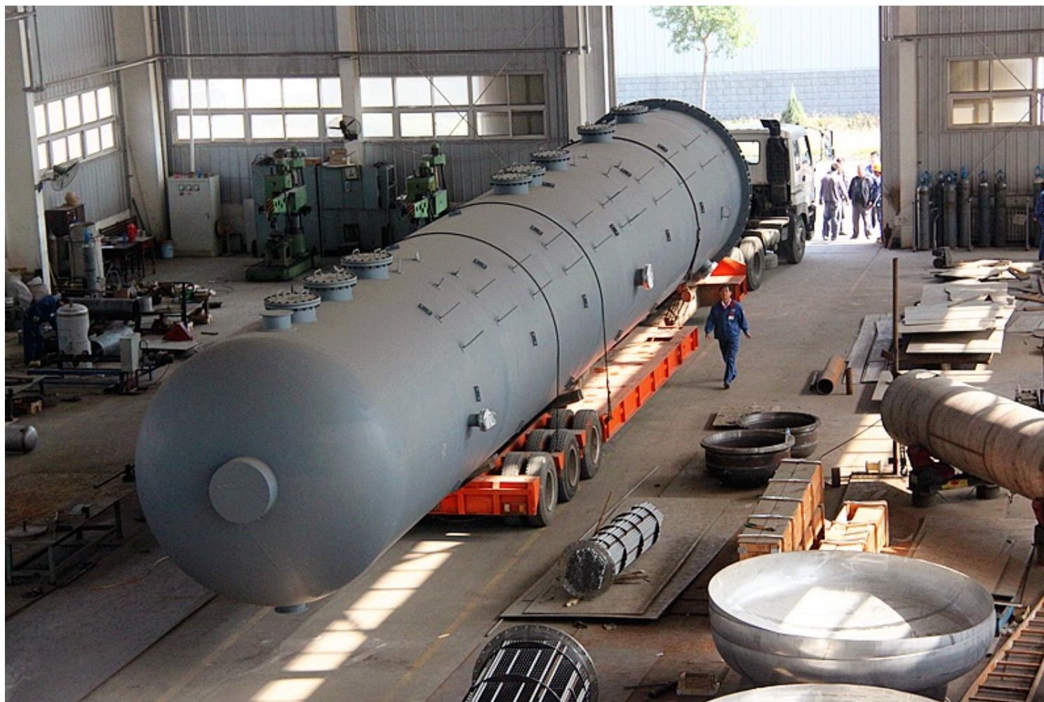
Kaifeng Air-separation Water Cooling Tower