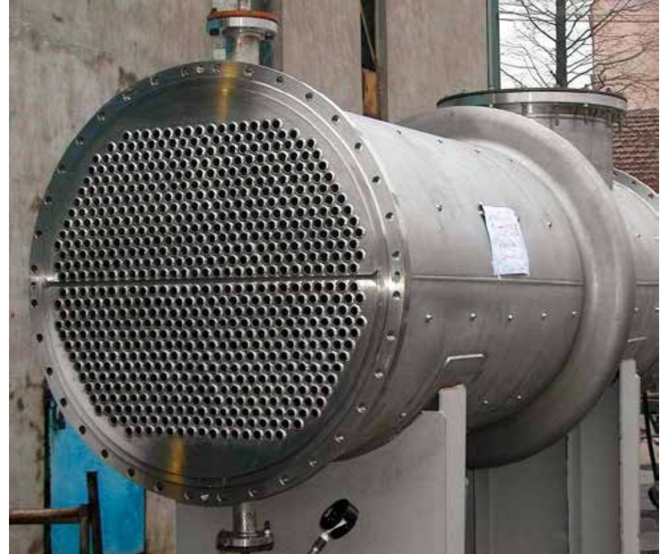
Tube Type Heat Exchange