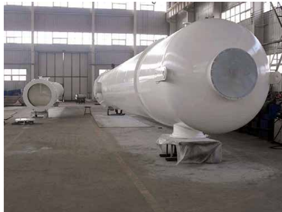
SIAD Air Cooling Tower Φ2000mm