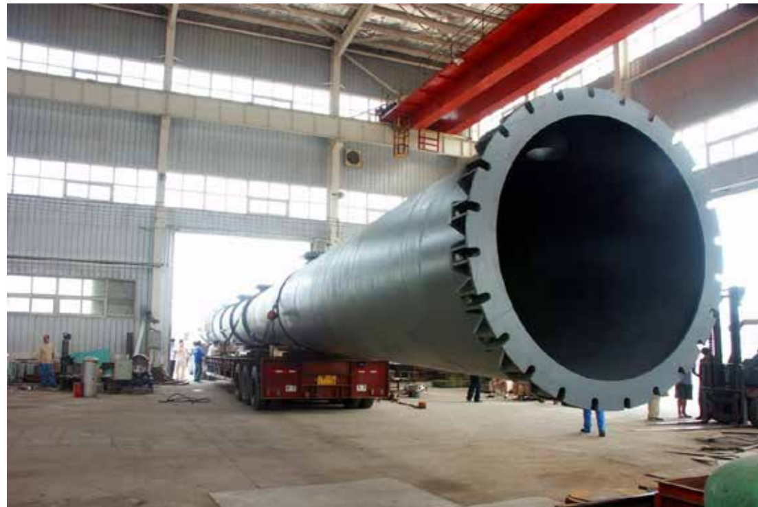
Xinjing JuLi Vacuum Column Height 30m , \Phi 800m