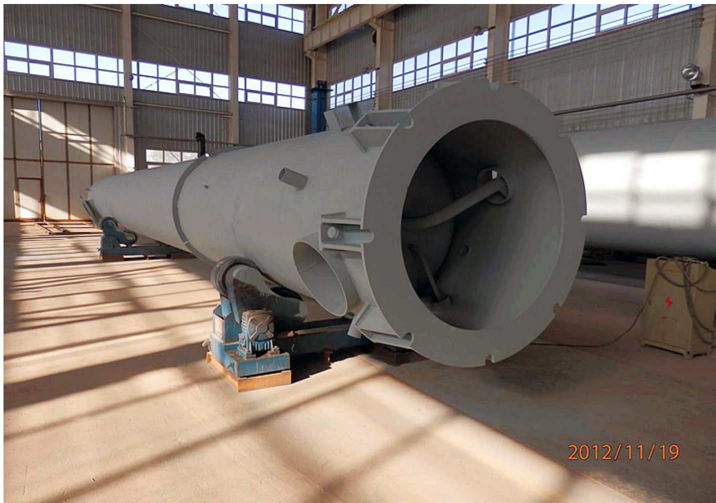
SIAD Water Cooling Tower Φ1400mm